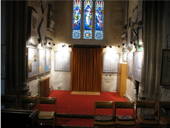
The St Nicholas display for the achievements of Admiral Arthur Phillip.

St Nicholas Bathampton church has progressed very well with their display boards and new lighting for their “Phillip Story”