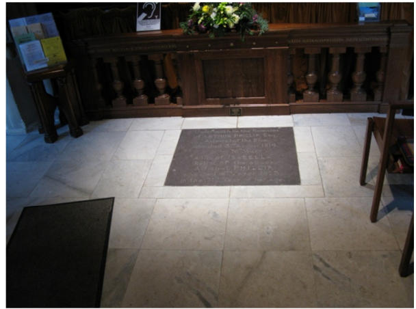
The ledgerstone over the grave of Admiral Phillip and his wife Isabella is now lit from above